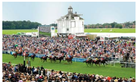
Why not join us at York!