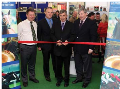
Opening the ITBA Trade Fair 2008