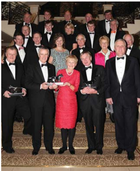
ITBA Award Recipients