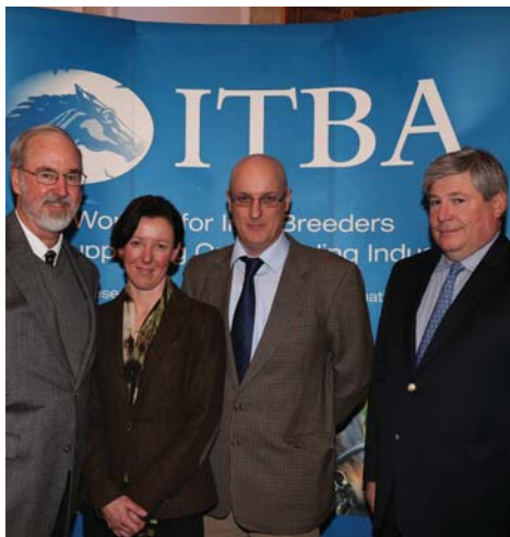
Session 2 Panelists