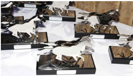
ITBA Awards trophies