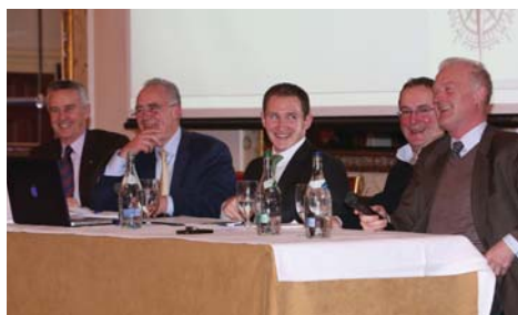
Session 3 Panelists